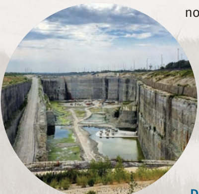
ERIC ALLIX ROGERS

The Columbia River is the largest river that flows into the Pacific Ocean and it once produced the largest salmon runs on earth. 42 However, today native fish populations