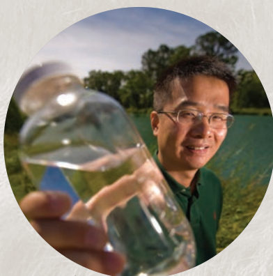
UNIVERSITY OF GEORGIA