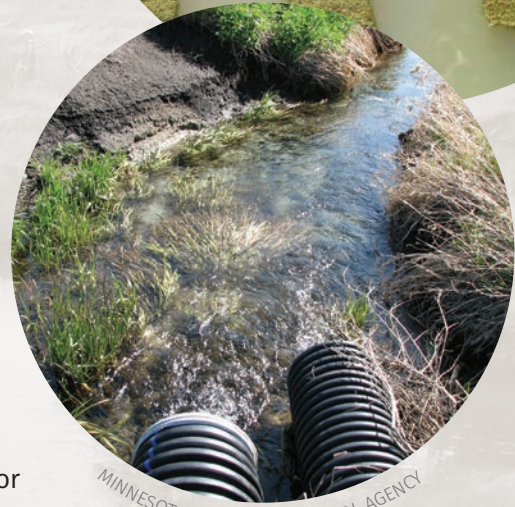
MINNESOTA POLLUTION CONTROL AGENCY

This collaborative approach resulted in strong, bipartisan support for the Federal Water Pollution Control Act Amendments of 1972, popularly known as the Clean Water Act.