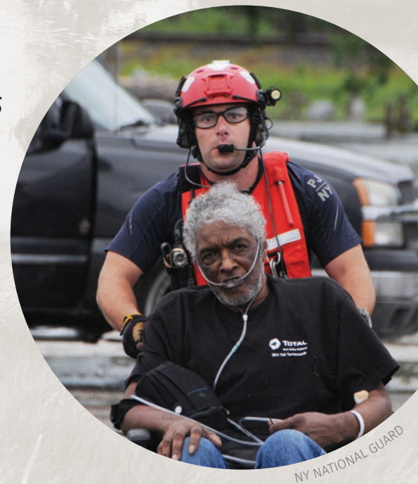
NY NATIONAL GUARD

Over the last decade, new challenges have emerged: Forests and fields are being lost to development that increases stormwater runoff. Extreme rainfall intensified by climate change is washing more pollutants into our waters, slowing progress.